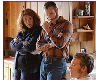
Scene from Wild About Harry

The movie is a wonderfully joyous film about a pair of Southern women who try and set their son/nephew up with the right man.